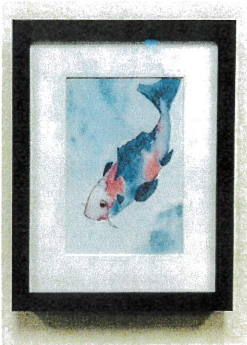
This is an example of the 8X10 inch frame, the artist used watercolor paint, and it is displayed with a mat board. Larger artwork will not have the mat board visible.